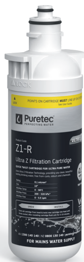
Z1-R replacement cartridge