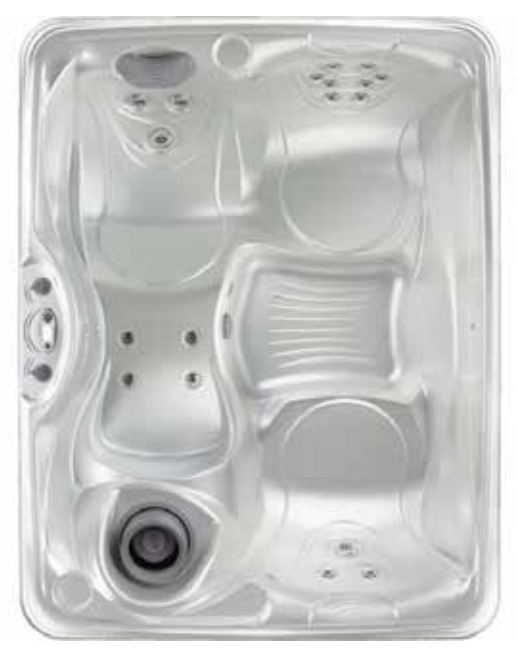
Stride shown with Pearl shell